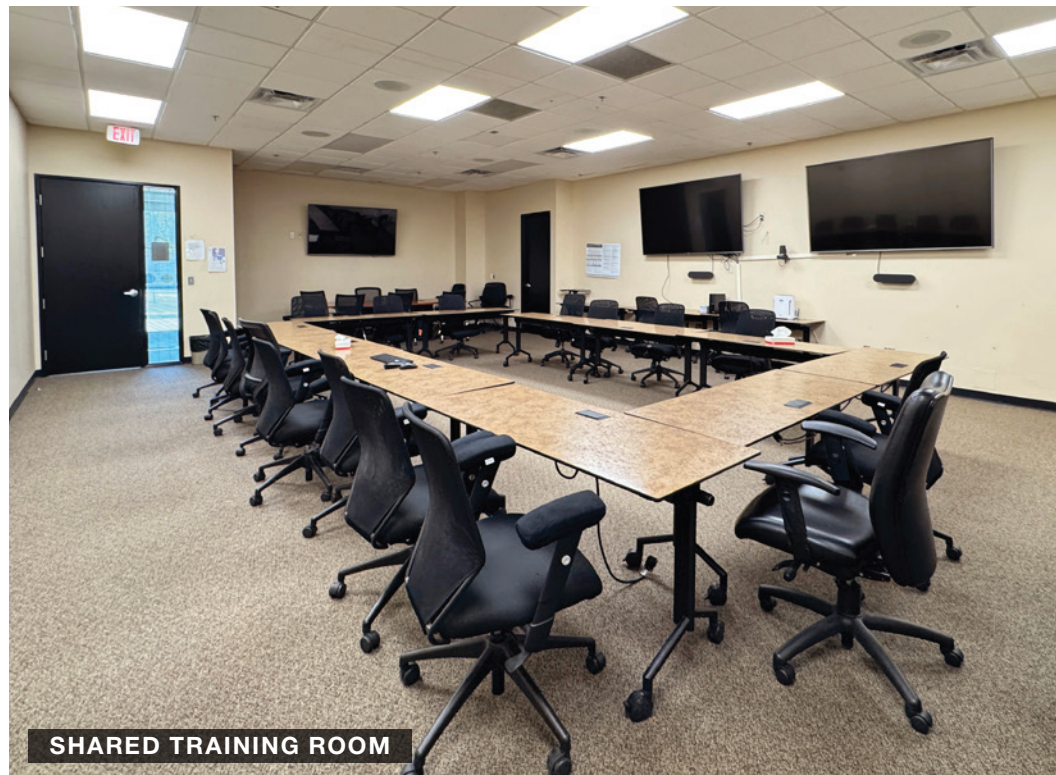
SHARED TRAINING ROOM