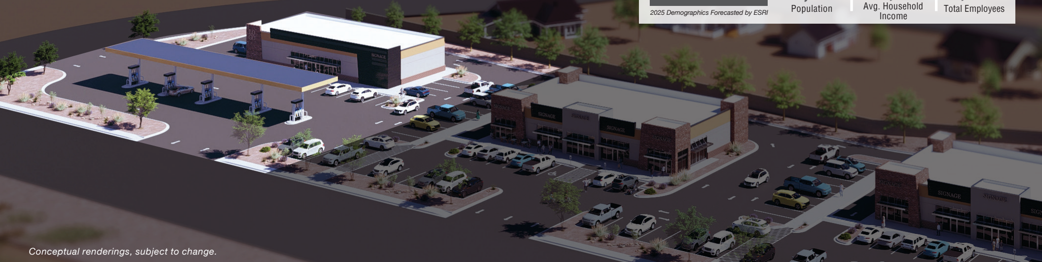
Conceptual renderings, subject to change.