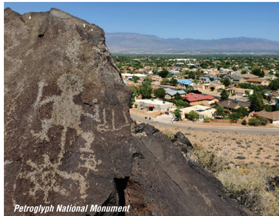
Petroglyph National Monument