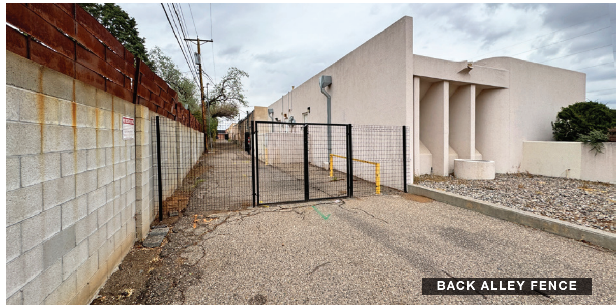
BACK ALLEY FENCE