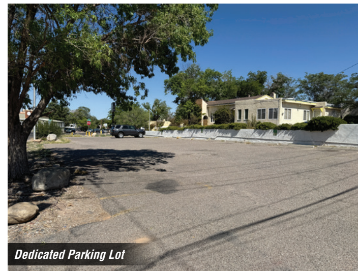
Dedicated Parking Lot