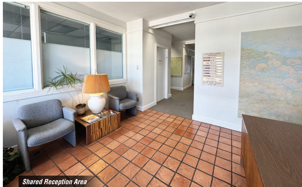
Shared Reception Area