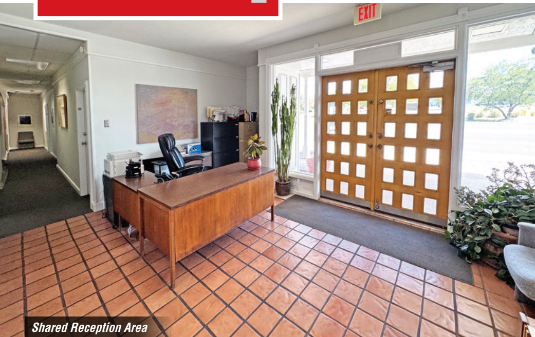
Shared Reception Area

2425 San Pedro Dr. NE | Albuquerque, NM 87110