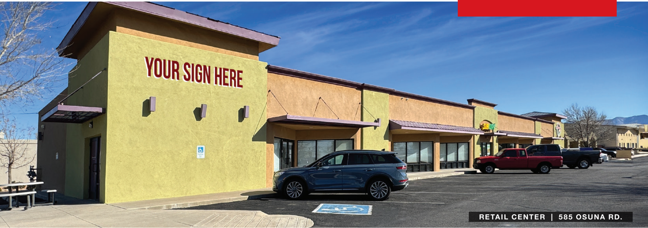
RETAIL CENTER | 585 OSUNA RD.