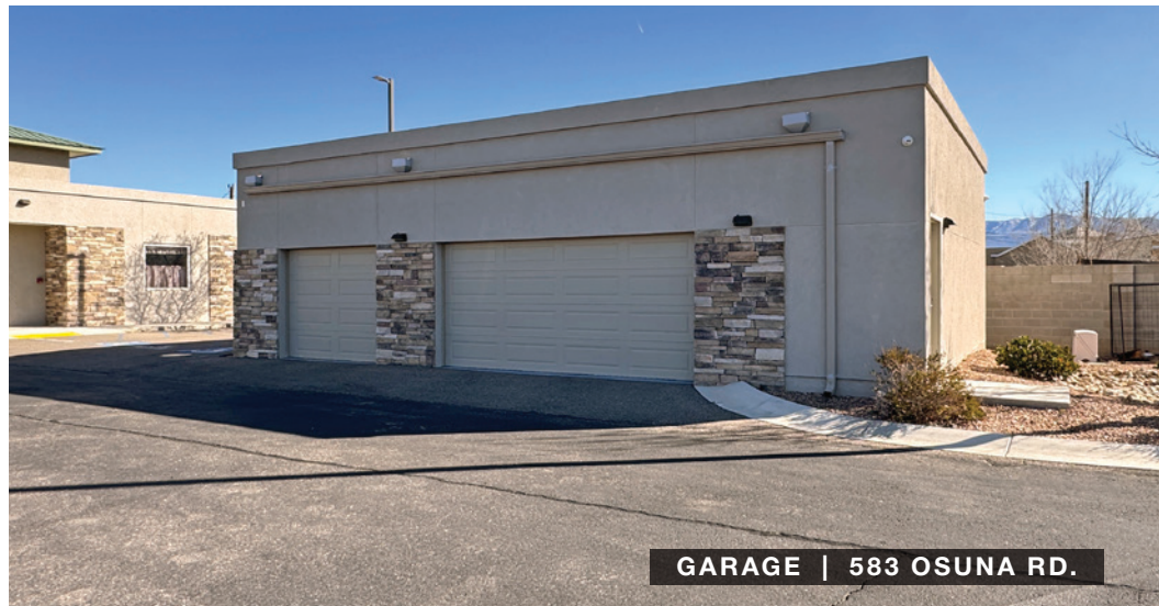
GARAGE | 583 OSUNA RD.