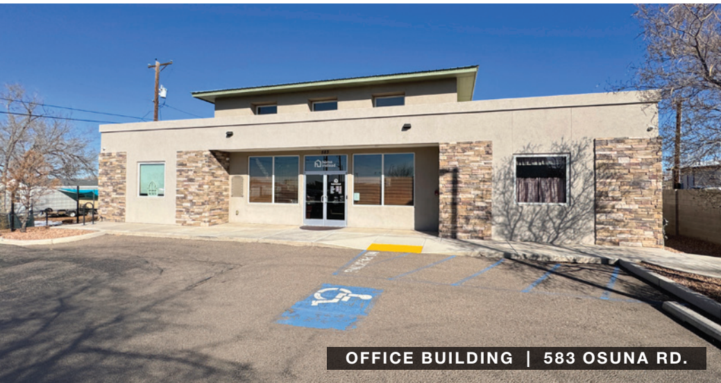
OFFICE BUILDING | 583 OSUNA RD.