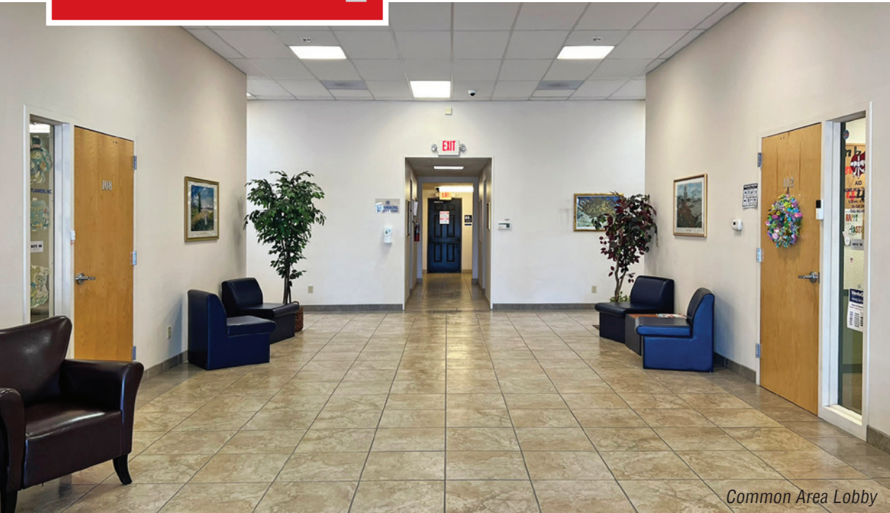
Common Area Lobby

2727 San Pedro Dr. NE | Albuquerque, NM 87110