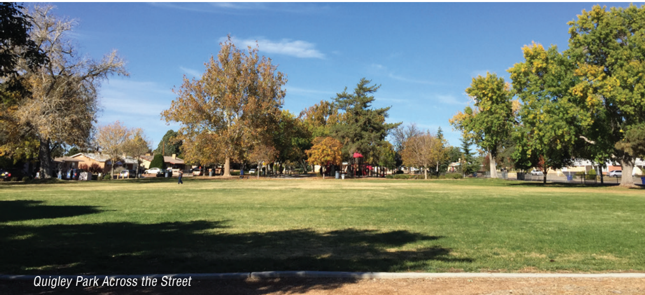
Quigley Park Across the Street