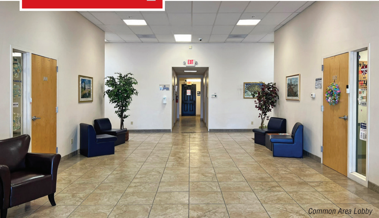
Common Area Lobby

2727 San Pedro Dr. NE | Albuquerque, NM 87110