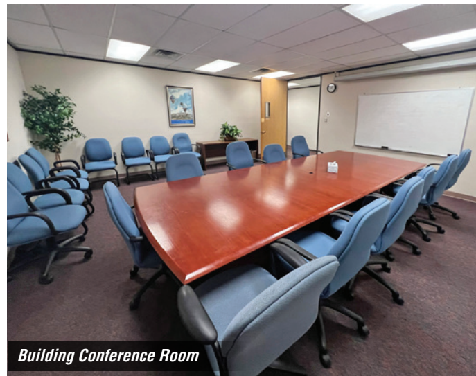
Building Conference Room