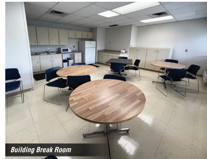
Building Break Room