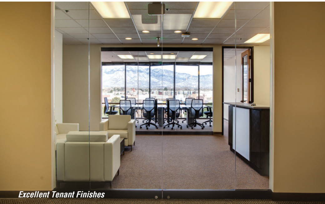
Excellent Tenant Finishes