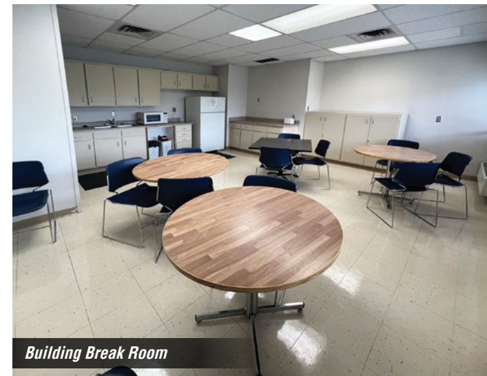
Building Break Room